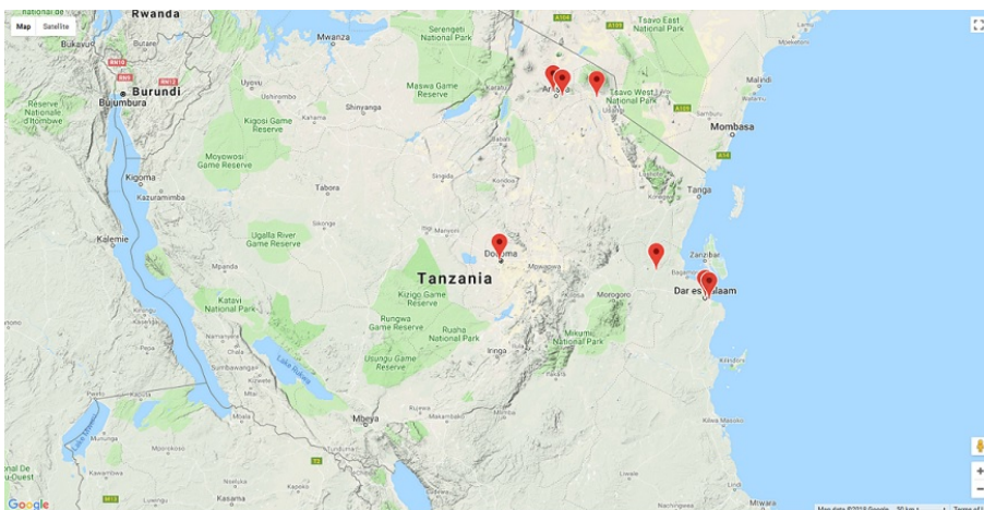
Figure 3. Map for Locating Counterfeits

that shall provide the service of pesticides products authenticity verification also reporting problems/complaints for products which haven't worked as expected.