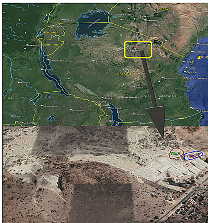
Fig. 2. The satellite image shows the geographical location of Minjingu Mines

g composite phosphate tailings sample was taken in each sampling location and put in a plastic bag and labelled. The samples were transported to the Tanzania Atomic Energy Commission (TAEC) laboratory in Arusha for analysis. The samples were dried for 24 hours at 100 °C in an oven. In order facilitate homogenization, the dry samples were crushed and put through a 500 µm sieve.