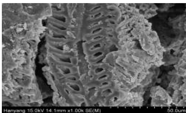
Figure 1 Scanning electron micrograph of activated carbon from peanut shell prepared under optimum conditions (activation temperature =573 K, activation time = 1hr and KOH: Char impregnation ratio = 1:2)