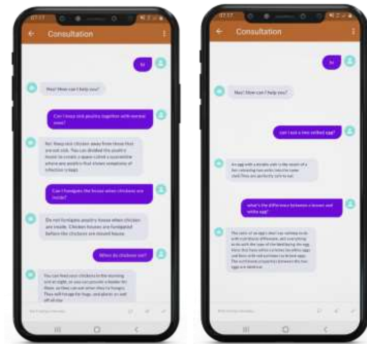
Fig. 3. Conversations on the Consultation Module.