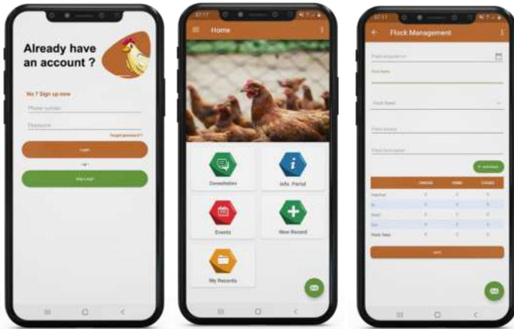
Fig. 2. Poultry Farmer's Mobile Application.