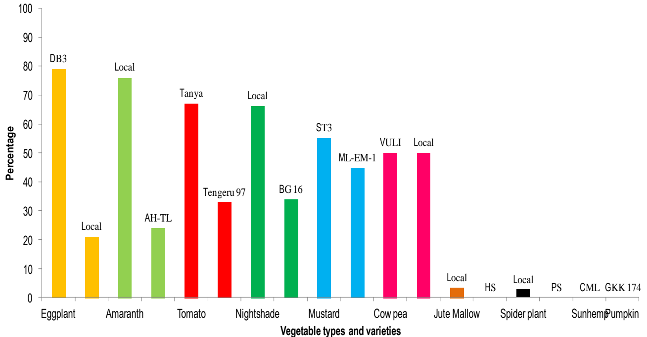
Figure 2. Vegetables varieties grown by farmers after receiving seedkit

The results also showed that farmers significantly [ \chi^2 = 16.73 , p = 0.005049 ] preferred more of the locally available vegetable varieties when compared with new varieties [of the same vegetable type] from the distributed seedkit. It was observed that the use of traditional knowledge contributed to increased utilisation of local vegetables. For example, local variety of nightshade was more preferred than distributed nightshade [ Solanum scabrum , BG 16]. This was similarly with amaranth, Ethiopian mustard, jute mallow and spider plant.