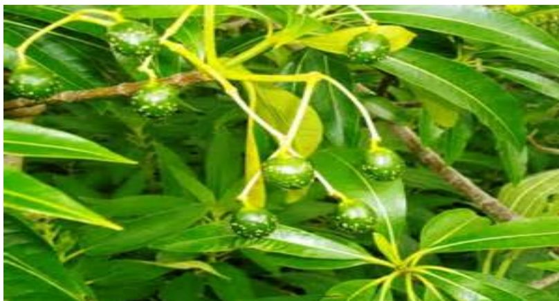
Figure 1. Rauvolfia caffra as found in the field at Uru North-Moshi