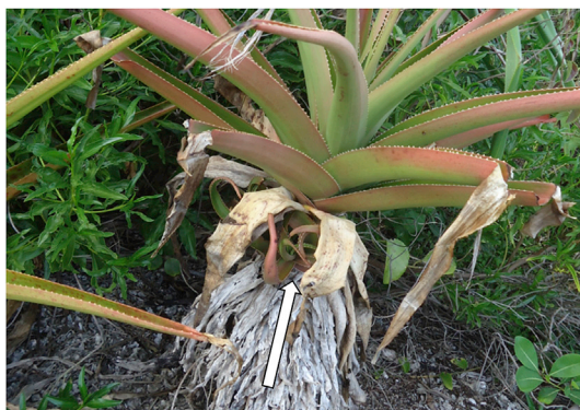
Fig. 2. Aloe pembana young vegetative shoot on the side of its upper stem at Pemba island, December 2018.

The species of “Least Concern”, A. lateritia , outperformed other species across all treatments in its germination success, followed by A. secundiflora and A. volkensii . This is supported by other researchers who reported the first two species being widely distributed across different geographical areas of various climatic conditions (Abihudi et al., 2019; Bjorå et al., 2015;