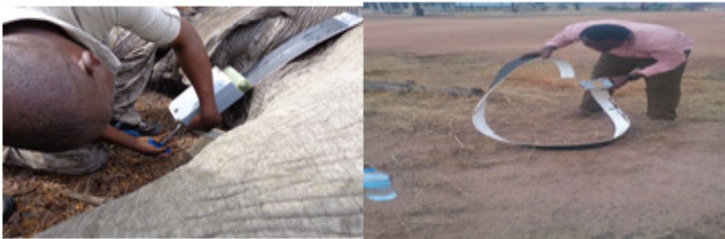
Figure1. Elephants Collaring at Ruaha National Park

On October 2016 we were invited by World Elephant Centre (WEC) for elephants collaring program at Ruaha national park. The main objectives of collaring the elephants was to monitor their seasonal movements and distribution patterns map their habitats and routes within and outside the reserves provide information to enhance their protection through rangers patrols and land use planning. The elephant collar to be fitted on the neck of an elephant consists of satellite GPS, temperature sensor and a powerful battery which can run for 3-5 years. The GPS on the collar sends information of the location and activity pattern of the elephant on specified time intervals such as every 20, 30 minutes etc. such information will be useful in mapping the activity pattern of the elephant as part of its monitoring. This is illustrated in Figure 1 with one of the co-authors from Tanzania with the GPS collars.