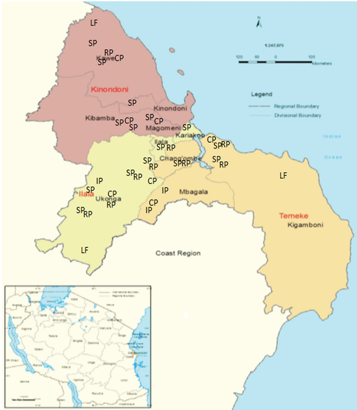
Figure 1. Map of Dar es Salaam showing the locations of waste facilities technology.