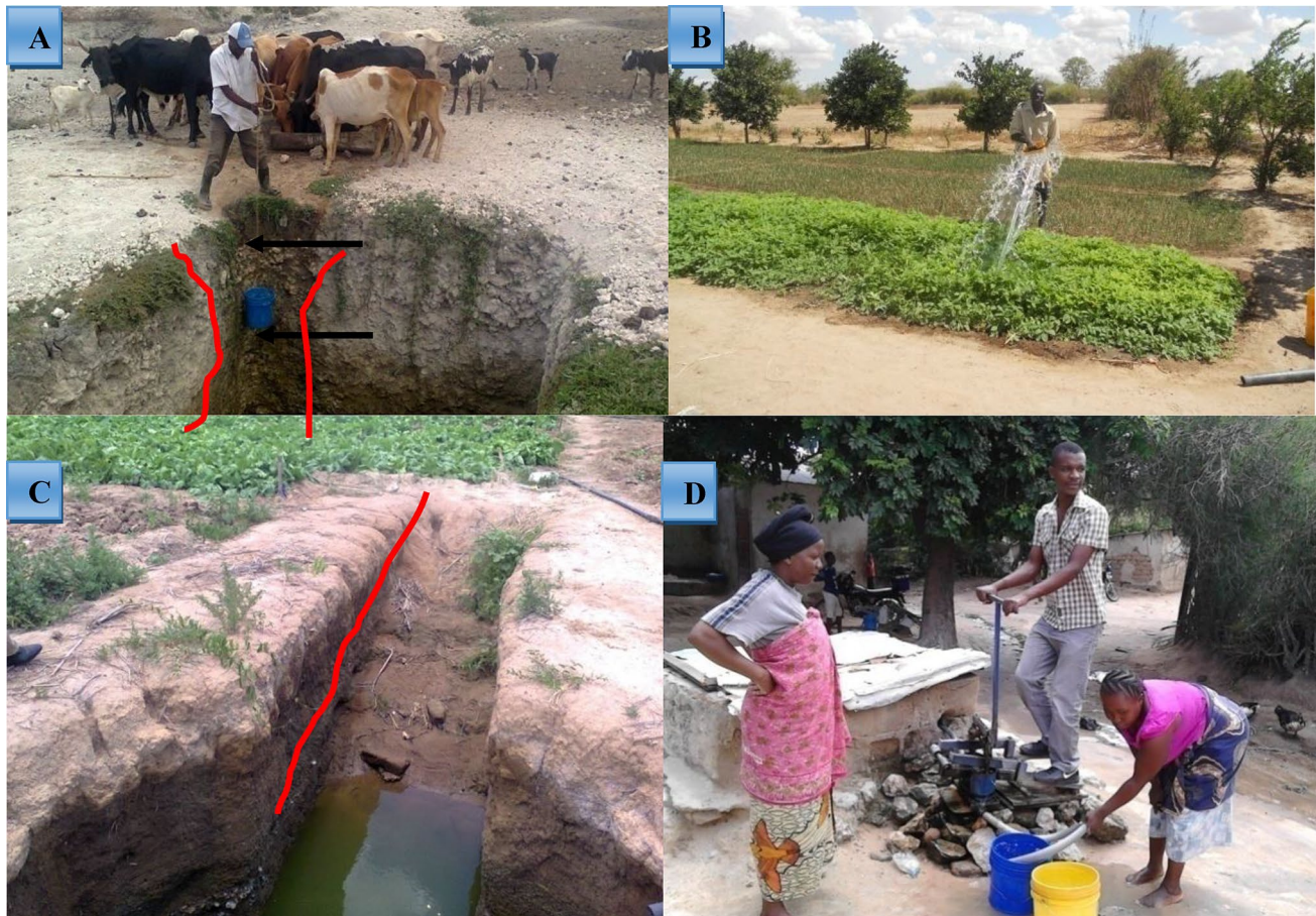
Fig. 1 Major SDWs uses, designs, types of water abstractions in Dodoma Municipality. a A pastoralist abstracting water for his livestock, and lack of proper SDWs completion practices making them susceptible to surface runoff which can easily contaminate the wells b shows a farmer irrigating a garden at Nzuguni using his own SDWs. a , c , d shows various types of traditional SDWs and pumping sys-

This study was carried out within the Dodoma municipality that is located between UTM zone 36, UTM 750,000 E through 945,000 E and 9,280,000 N through 9,380,000 N (UTM, Arc 1960) (Fig. 1). Meteorologically, the area is in a semi-arid region of Tanzania with low (550 mm/year) unimodal rains falling between October and May. Temperatures are lowest in July (about 13.0 °C) and highest in November (about 30.6 °C). The semi-aridity nature of the area can be