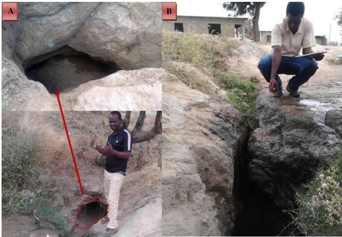
Fig. 4 Showing SDWs placed along natural fault systems. a Dowsing rods crossing on top of a SDW dug along a fault in Mahoma Makulu. b A very productive SDW along a fault system that is used for domestic and irrigation at Mtumba suburb. However, both wells are

vulnerable to pollution from runoff and periodical removal of debris is necessary. The SDWs in Mtumba are among the most productive in the area with an average yield of about 17 \text{ m}^3/\text{h} (Shemsanga et al. 2017)