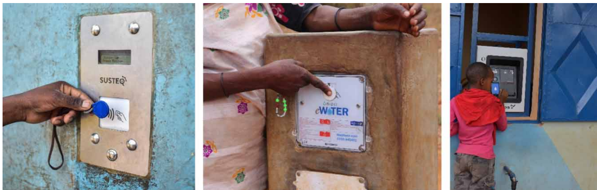
Fig. 2. Photograph of the three prepaid technologies in Kishapu, Babati, Karatu in order from left to right.

The study was carried out between March and April 2019 in three purposively selected districts of Kishapu (Maganzo ward), Karatu and Babati in Tanzania. These were districts where three different types of prepaid technologies have been in use for over a year ( Figure 2 ). The first two cases, Kishapu and Karatu, are of mixed urban and rural context, while in the third case study, Babait district, the schemes are in two rural villages.