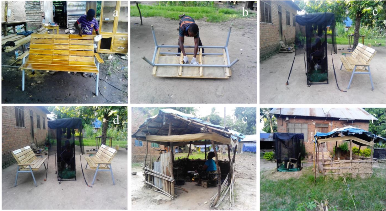
Figure 3: Illustration for efficacy evaluation of transfluthrin-treated chairs and transfluthrin-treated hessian ribbon

Key: a = Design and prototyping of the wooden and metal flame chairs at the local carpentry, b = fitting transfluthrin-treated hessian mat underneath the chair, c = one transfluthrin-treated chair with the DN-Mini trap (Limwagu et al. , 2019) installed about 0.5 m from the chair, d = two transfluthrin-treated chairs with DN-Mini trap installed about 0.5 m from each chair, e = outdoor kitchen fitted with transfluthrin-treated hessian ribbon with CDC light trap installed within it and f = outdoor kitchen fitted with transfluthrin-treated hessian ribbon with DN-Mini trap installed about 1.2 m from it