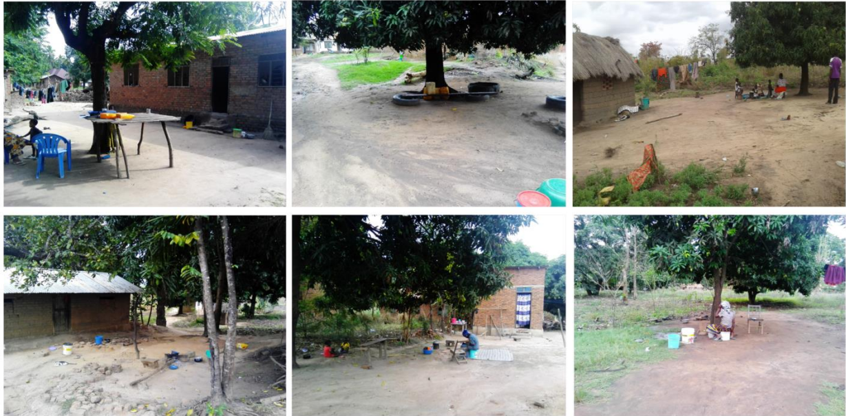
Figure 6: Illustration of houses with non-built-up peridomestic space physically characterized as under the tree