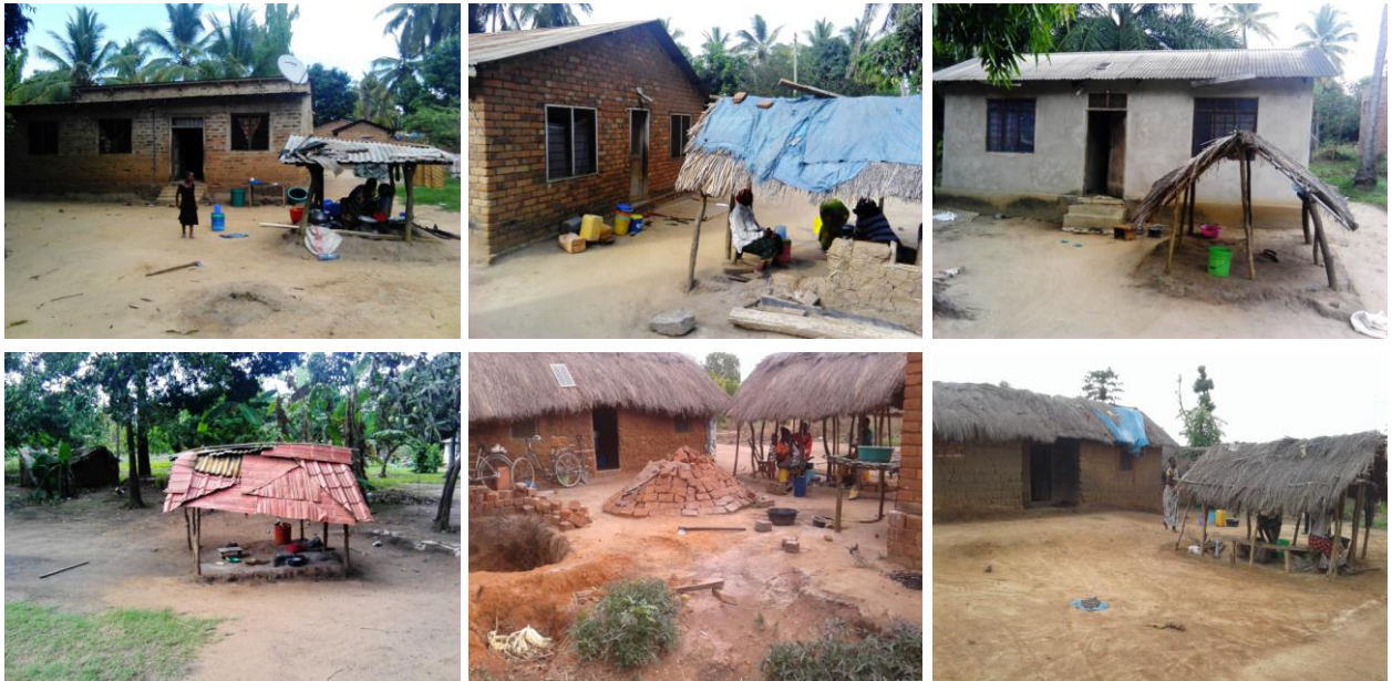
Figure 5: Illustration of houses with built-up peridomestic space away from the main house commonly used for cooking