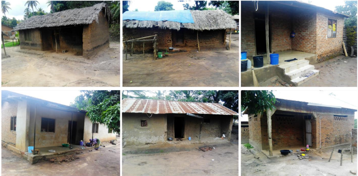
Figure 4: Illustration of house with veranda extension physically characterized during survey