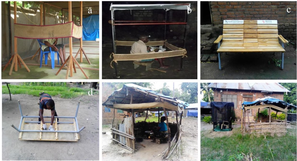
Figure 1: Stagewise development on the use of transfluthrin-treated chairs and transfluthrin-treated hessian ribbons

Key: a = Illustrating the original transfluthrin-treated hessian ribbon as previous described (Ogoma et al. , 2012), b = field evaluation of transfluthrin-treated hessian ribbon (Govella et al. , 2015), c = transfluthrin-treated chairs prototype evaluated in this study, d = fitting of transfluthrin-treated hessian mat underneath the chair, e = example of outdoor-kitchens installed with transfluthrin-treated hessian ribbon and f = example of outdoor-kitchens installed with transfluthrin-treated hessian ribbon with a miniaturized double net trap installed about 1.2 m from kitchen (Limwagu et al. , 2019)