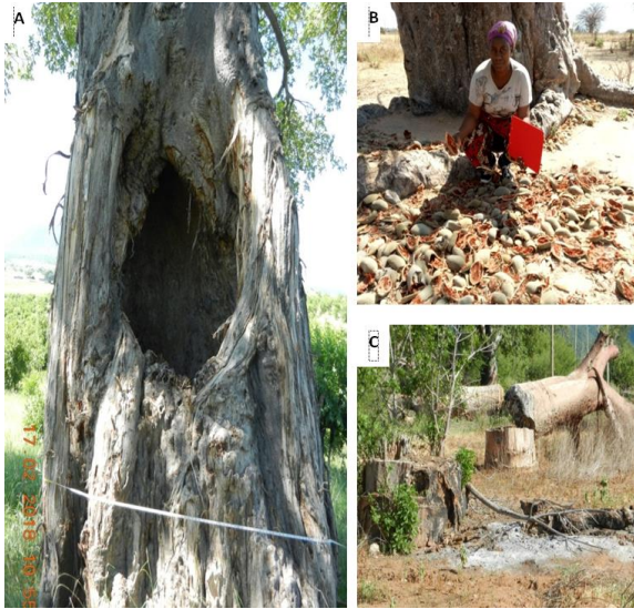
Plate 2. Severely elephant damaged baobab trunk in Ruaha National Park, Tanzania (A), harvested baobab fruits in Central Tanzania (B) and felling of baobab trees and use of fire to create a farmland (C).

Destructive harvesting methods are detrimental to the tree hence reducing the baobab population. Currently, local communities use traditional harvesting techniques of baobab fruit including shaking the branches and knocking the fruits using sticks, which frequently result in substantial losses. An increase of baobab ingredients both in food and pharmaceutical industries has caused local community harvest all fruits leaving nothing in the field (Plate 2B). This may result in unstable populations in the future. Moreover, cultural practices including debarking and root harvesting for various uses may have an impact on the tree growth and survival. There is a need to conduct a thorough investigation on the impact of the cultural practices on the sustainability of the baobab in the semi-arid regions of Tanzania.