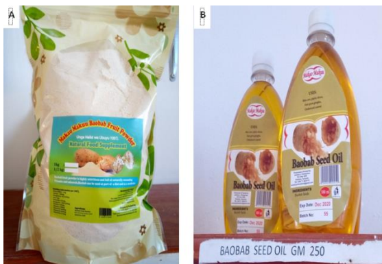
Plate 1. Processed baobab products in Central Tanzania: (A) Baobab powder extracted from fruit pulp, (B) Baobab oil extracted from seed.

In protected areas, elephants utilize baobab, especially in times of resource inadequacy (Owen-Smith, 1988; O'Connor et al. , 2007; Hayward and Zawadzka, 2010; Biru and Bekele, 2012). A study by Barnes et al. (1994) found that baobab densities declined due to elephant browsing in Ruaha National Park. Baobab trees were also slightly affected for the same reasons in Lake Manyara in 1969 and 1981 (Owen-Smith, 1988). During this period, only 13% of the trees remained undamaged, but the annual tree mortality stood at 1% per annum (Owen-Smith, 1988). There is a need to conduct a study on the impact of elephants on baobab population structure in protected areas.