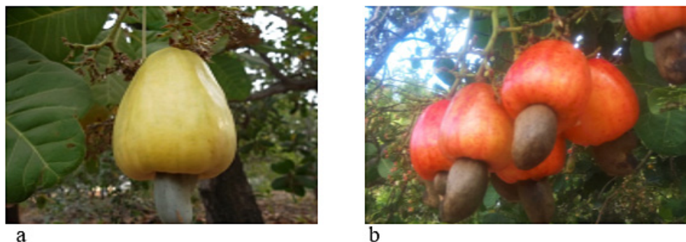
Fig. 2: Yellow (a) and Red (b) cashew apple varieties are attached to the tree on one end and to the nuts on the other 22, 41

Cashew apple has received less attention in some countries, including Tanzania, where it is neglected and considered a by-product of cashew nut production. They are not preciously consumed or sold fresh and have not been processed as value-added products. The underutilization of cashew apples, which are either left to rot in the field after the nuts are harvested, or only a small portion of the total yield is used as fresh fruit in the field during the nuts' collection, or they are fermented to unregulated non-commercial local brew called "Uraka" in Swahili. 6