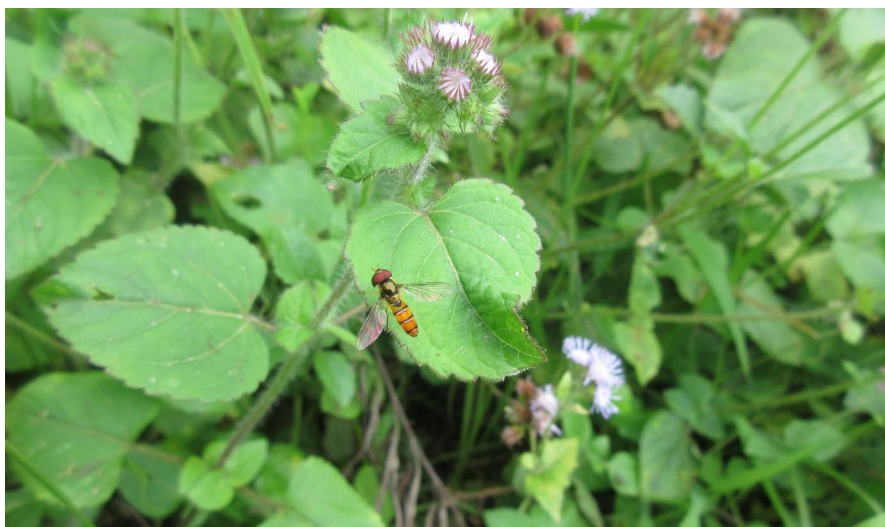
Figure 2. Field picture of adult hoverfly.