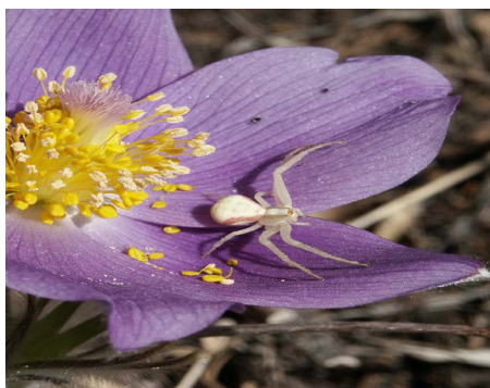
Figure 6. Crab spider.