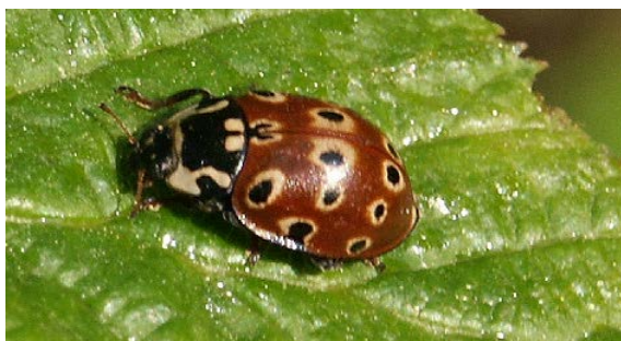
Figure 3. Adult lady beetle (Source [19]).