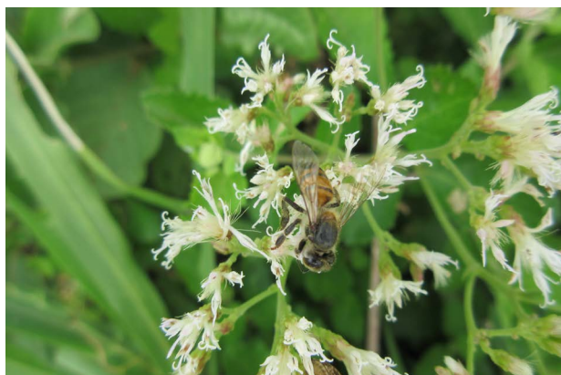
Figure 7. Field picture of the European honey bee.