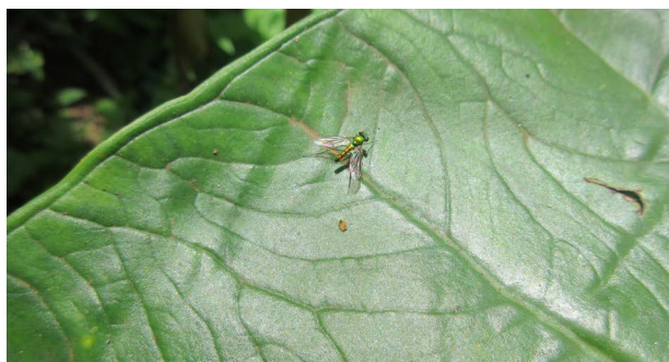
Figure 4. Field picture of adult long-legged fly.

Both the larvae and the adults are predators. They prey on aphids, thrips, young caterpillars, and mites. They are also likely to be predators or scavengers in detritus and soil [8]. Dolichopodidae plays a potential role in pest regulation. Little is known on the long-legged flies and their roles in agricultural fields especially in bean fields. There is a need of generating more information on the long-legged flies and the role (s) they play in control of pests to promote the control of pests in bean field.