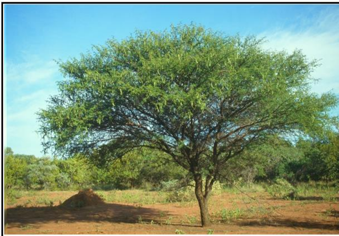
Fig. 1. Acacia nilotica .

being removed from OP exposure is very crucial in order to resolve the over accumulation of ACh in both control and treated group. Results of this present study shows that there is a sex variation which indicates that the female sex group is at higher risk to be affected by OPs compared to the male mice, similar statement as reported by Comfort & Re, (2017) and Ngowi et al. , (2017).